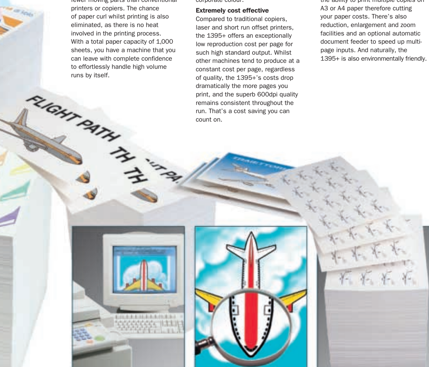
Optional controller allows on-screen design using various colour ink options

The 1395+ is so fast and simple to set up, whatever your print demands are. Exchanging an optional colour drum is equally quick and easy; it's all done in a matter of seconds. Another feature you'll appreciate is the ability to print multiple copies on A3 or A4 paper therefore cutting your paper costs. There's also reduction, enlargement and zoom facilities and an optional automatic document feeder to speed up multi-page inputs. And naturally, the 1395+ is also environmentally friendly.