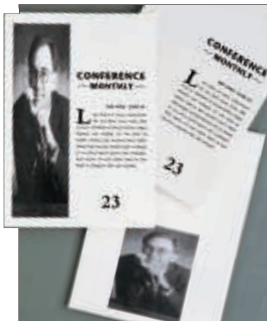
Independent horizontal/vertical manipulation adds creativity

The optional RCP80 controller from Rex-Rotary brings connectivity to your CopyPrinter, enabling high-speed digital printing across your network. With Adobe Postscript 3 as standard, the RCP80 ensures graphic images are accurately processed without delay. Productivity is further enhanced by the addition of SmartNetMonitor, which puts users and administrators in full control of networked document communications.