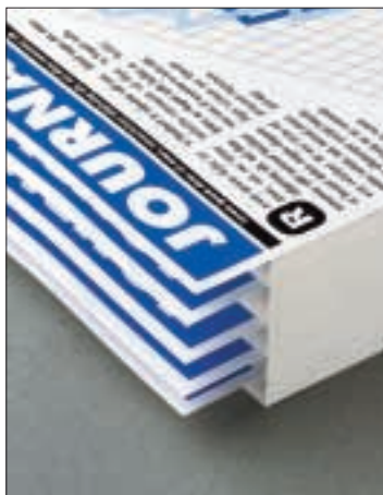
Unique tapeless job separator for convenient collation