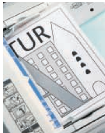
Face-up ADF for instant confirmation of print output